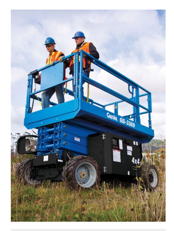
Swing-Out Engine Tray